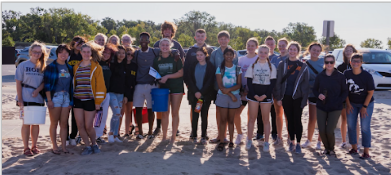
The Green Team!